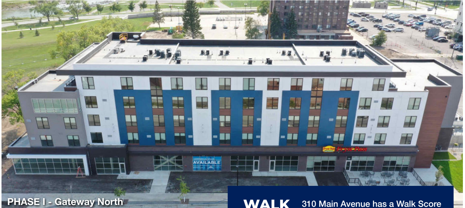
PHASE I - Gateway North